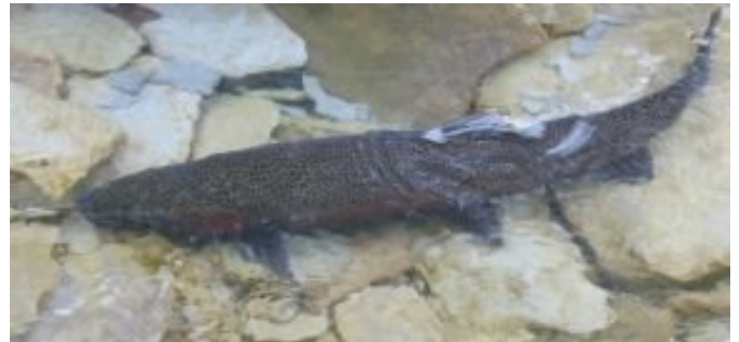
Shallow water Steelhead

We invite all club members to submit photos of fish, fly-fishing or other fly-fishing related topics. We will pick the best ones and include them in the newsletter. If you would like to submit a short write up with the photo, that will be considered as well. Send all submissions to.