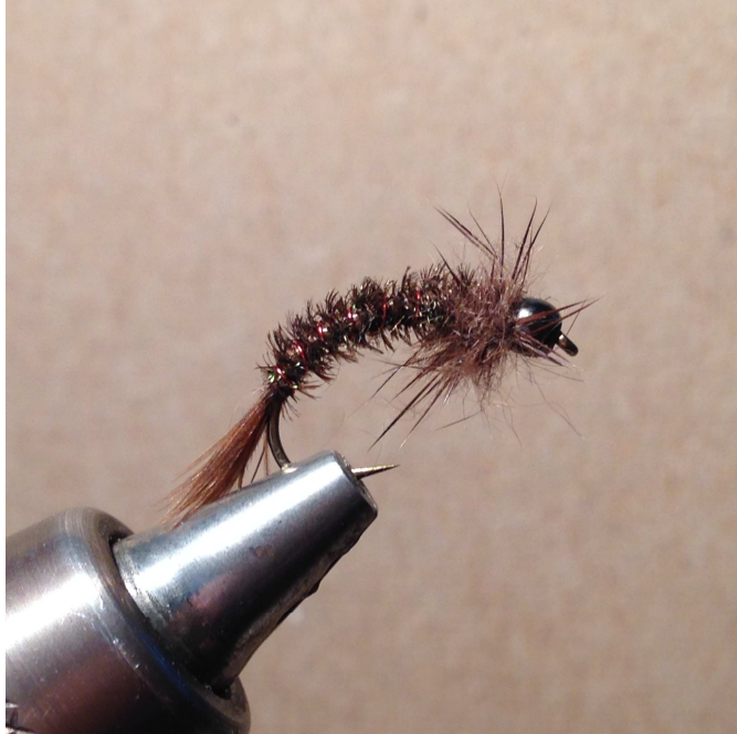
Craig Buckbee's Uncle Fester Nymph