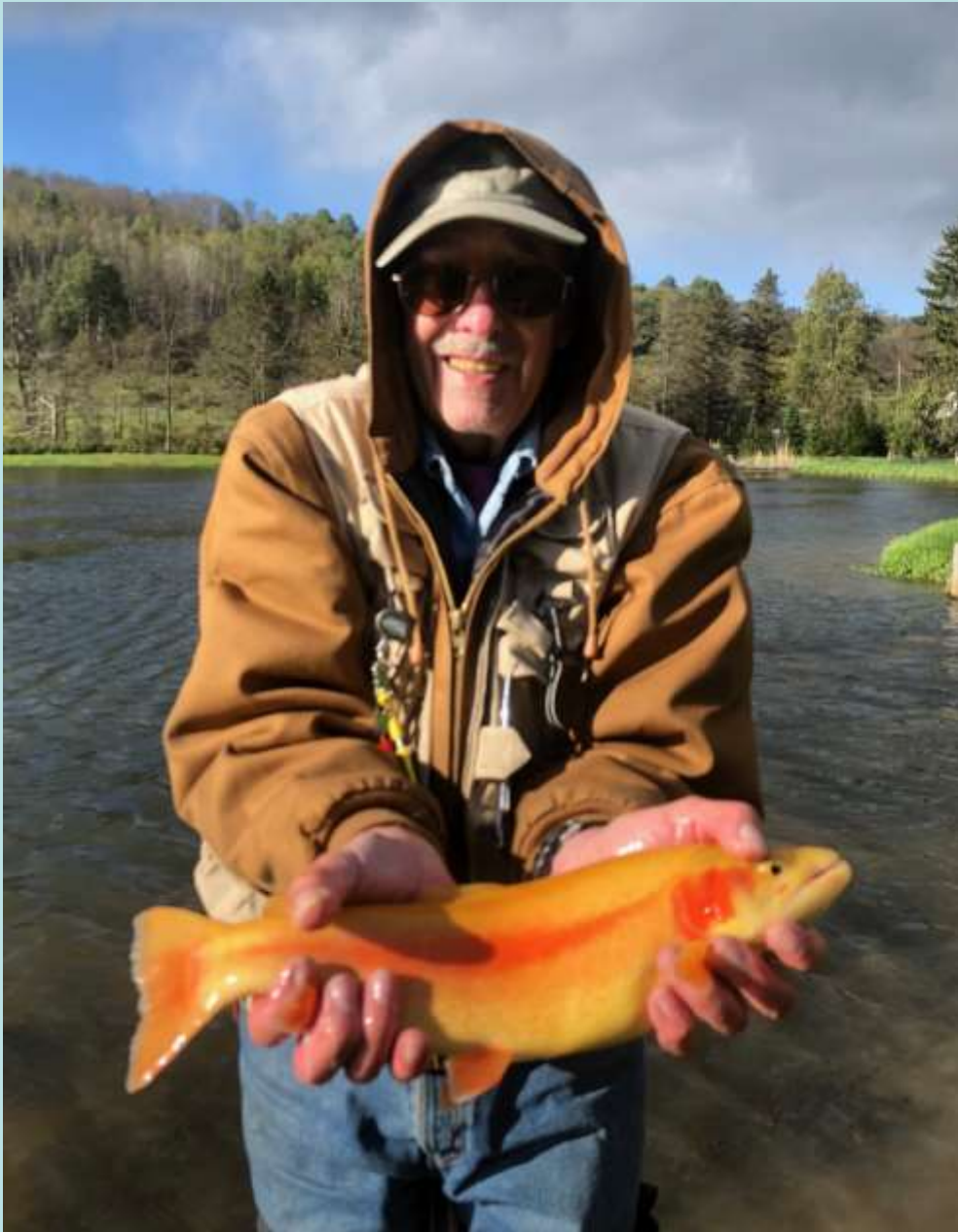
George Roy Hospitality