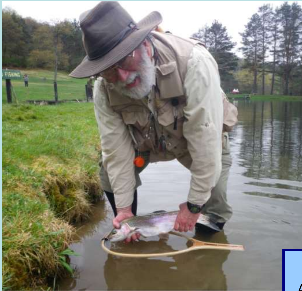
Gene Nowlan Academy Audio-Visual and Logistics